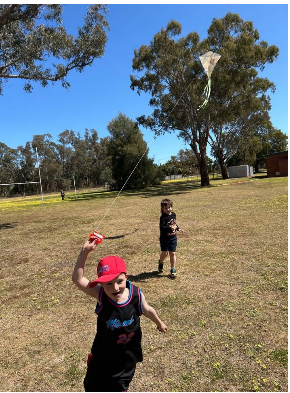
The students enjoyed flying the kites they made in Canberra on the last day of term 3!